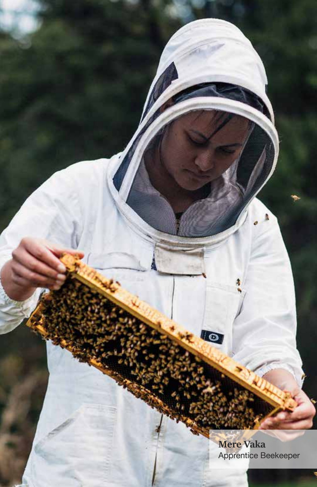
Mere Vaka Apprentice Beekeeper